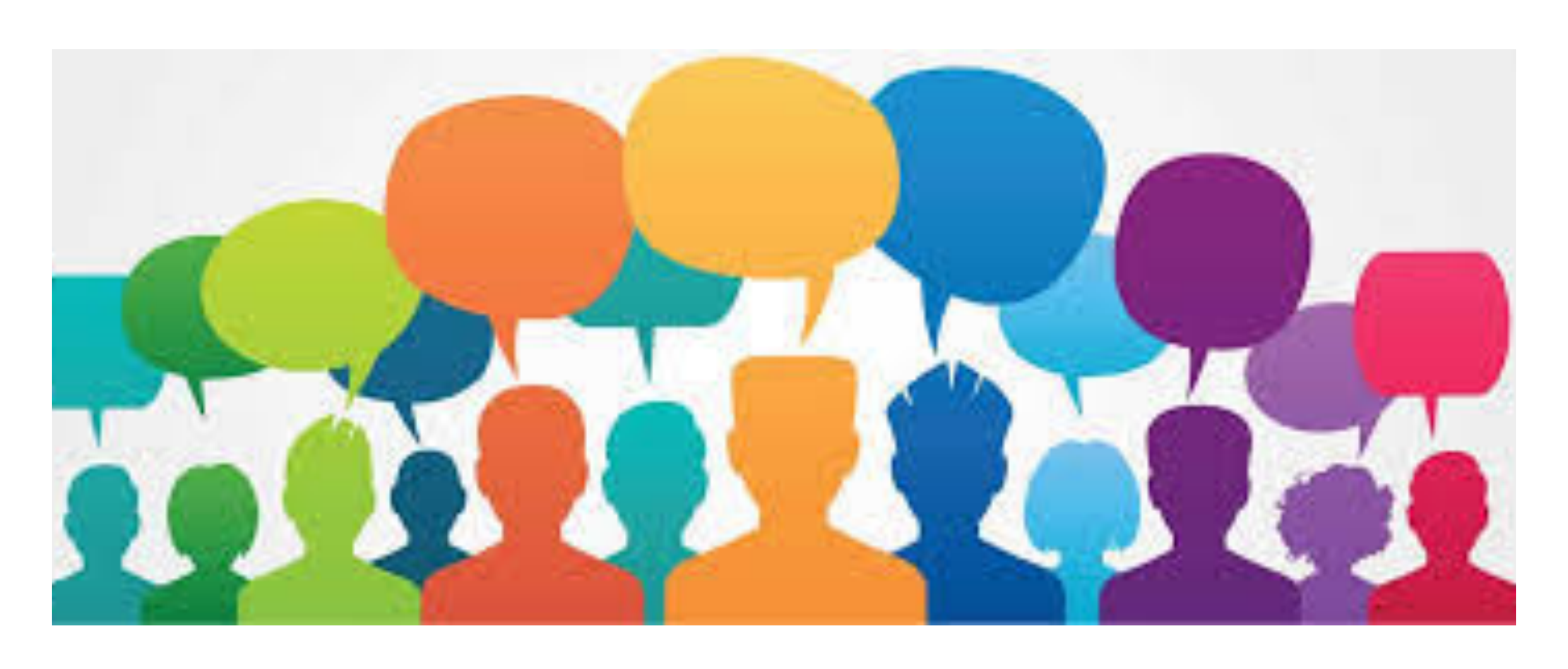
Questions or Comments?