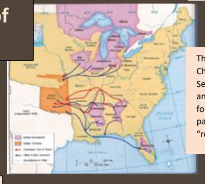
The members of the Cherokee, Muscogee, Seminole, Chickasaw, and Choctaw were forced to take these paths to a new land "reserved" for them.