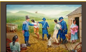
The Trail of Tears was a series of involuntary dislocations done by the United States government of nearly 60,000 Native Americans between the years of 1830 and 1850.