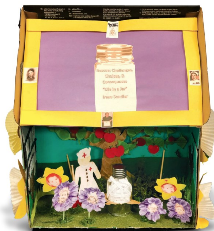
A Life in a Jar

The color scheme includes light blue, green, brown, red, violet, and yellow to give it a calming and playful emotion in spite of hardship and glum.