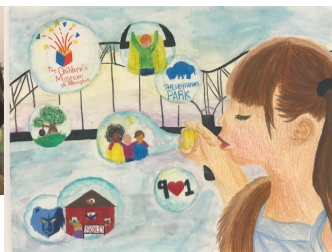
Hadley Lawler- 2nd Place