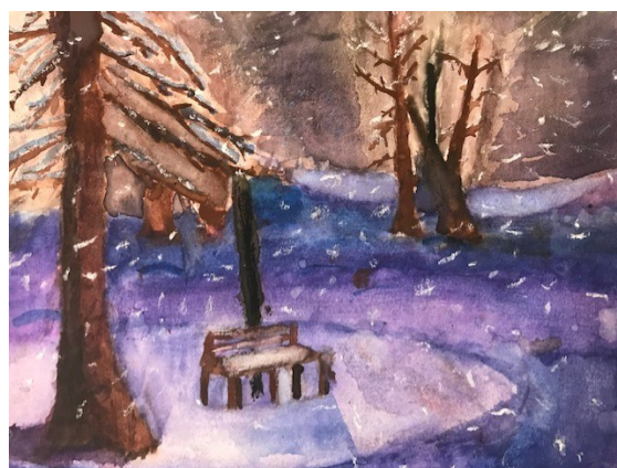
Bruce Black, 9th Place, 6th Grade Division